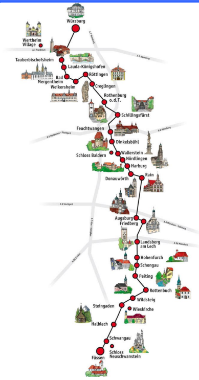
The Romantic Road

Call or text (907) 378-3624 or e-mail: goldtops@msn.com